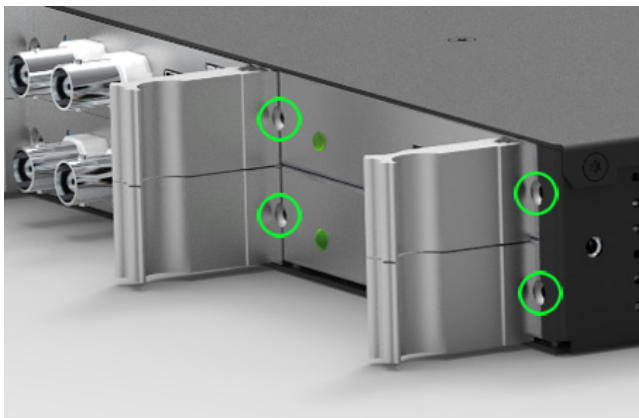
Attachment points of an 1U IMS system